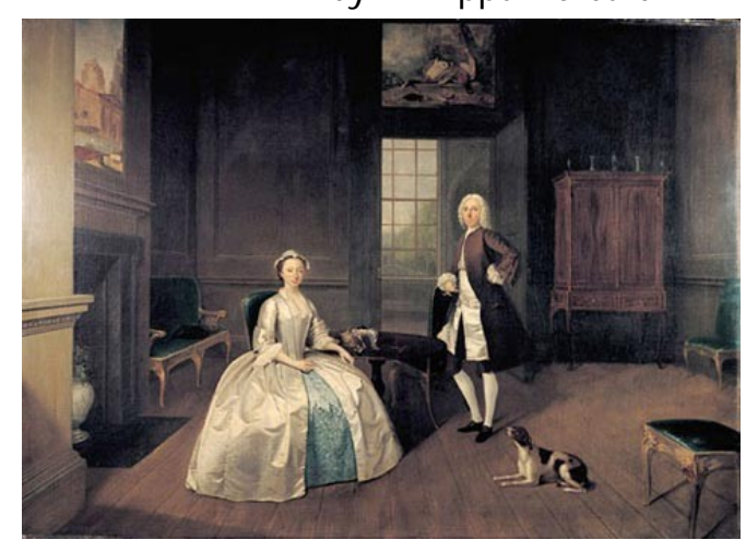
Mr. and Mrs. Atherton by Arthur Devis, oil on canvas, ca. 1743